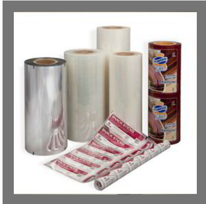
Flexible Packaging Rolls