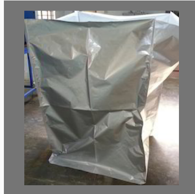
Jumbo Bags for Machinery Packaging