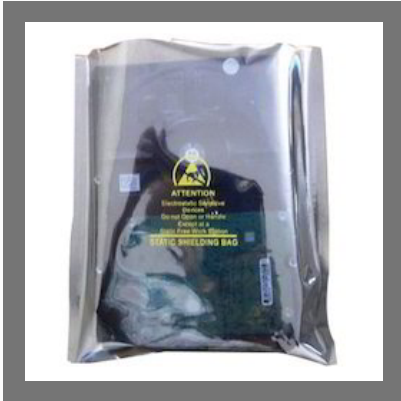
Static Shielding Bag APSTAT-1265