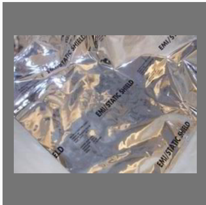
Machinery Jumbo Bag (EMI/RFI & Static Shielding)