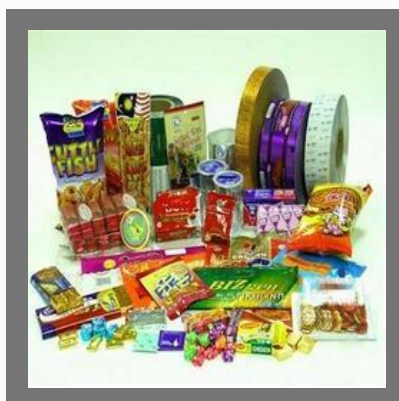
Printed and Laminated Rolls