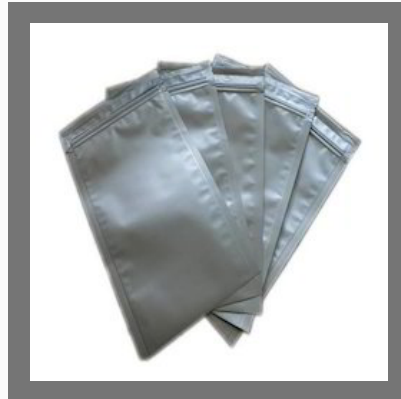
Moisture Barrier Bag: APMB- 1100