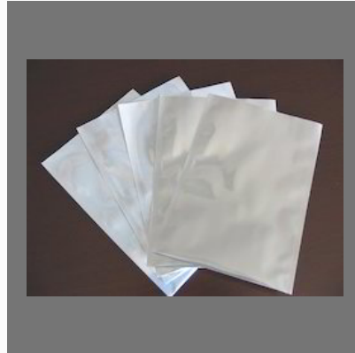
Moisture Barrier Bag: APMB 700