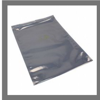
Static Shielding Bag APSTAT 1265Co