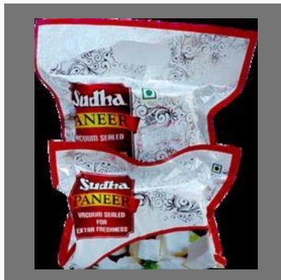
Paneer, Tofu & Dry Fruits Packaging Pouch