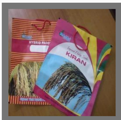
Preformed Pouches and Bags