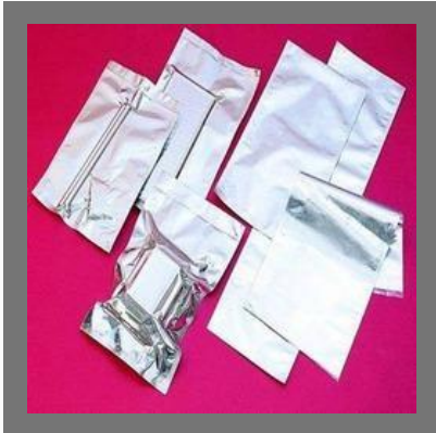
Moisture Barrier Bag: APMB 550