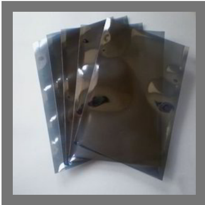
Static Shielding Bag APSTATMB